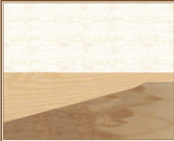
3 veneers chosen to form the waster/background

The important element here is that the shading effect has a wonderfully natural gradient from light to dark which replicates the diffused shadow outlines you would see as a normal visual aspect of genuine daylight shadow.