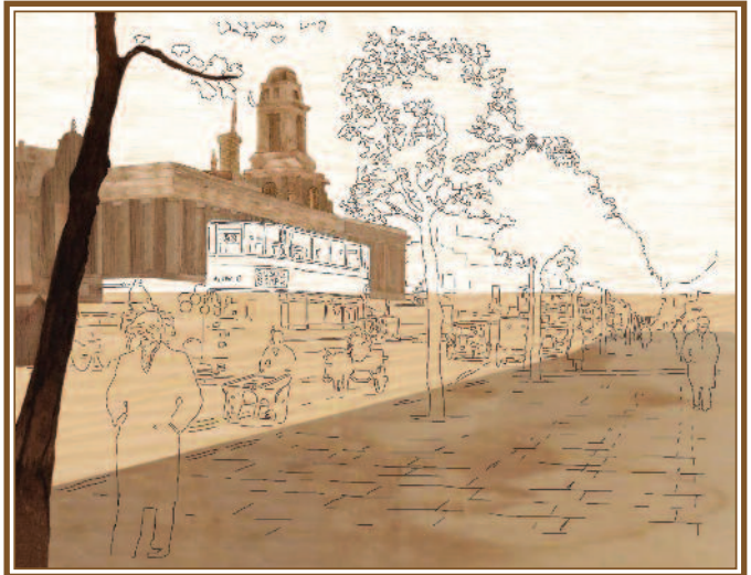
To add some definition and a contrasting element, the tree on the left together with more building are added

An encyclopaedic knowledge of veneers could, in this instance, be something of an impediment to choosing the best veneers for a photo realistic production. There are many recommendations of veneers best suited for various tasks, but these recommendations may well restrict the best choice for photo realism just because a few books and accepted 'knowledge' says otherwise.