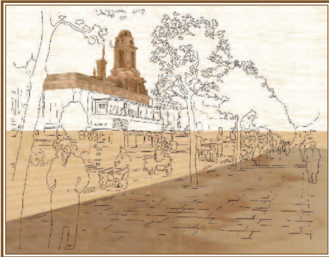
The clock tower and roof of the main building are cut in. We now progress onto the columns and the walls .

As well as shadow and ‘impressionist’ art techniques, I also try to limit my palette. What I mean by this is that I restrict the amount of different veneers I use for my pictures. Yes I know we have hundreds, even thousands, of different veneers at our disposal, but again it’s like oil paint, of course there are hundreds and thousands of different colours in that. But, just because there are multitudes of colours we don’t use them all at one go, we limit what we use for the job in hand. It may (and generally does) result in choosing say about seven colours and making what we need for the work by mixing and combining from those basic colours.