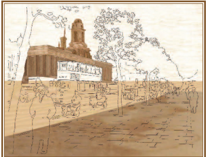
The columns and walls of the main building are cut and inserted into the picture

As you will have gathered, I prefer to concentrate on an artistic approach to my marquetry rather than follow a ‘rulebook’ standardised style of work. To this day I still only know a handful of the veneers I work with. I select my veneers by just looking through boxes of them until I spy