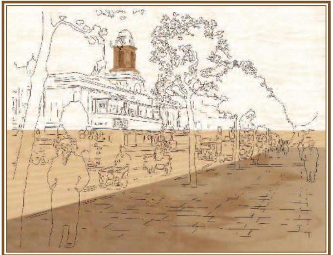
More of the clock tower cut in and the design redrawn to indicate where the overhanging leaves will appear

The usual marquetry methods for depicting the leaves on trees are either to use a fragmentation mixture, or use a burr as the main element and then cut in a handful of leaves to give the illusion of a lot of foliage.