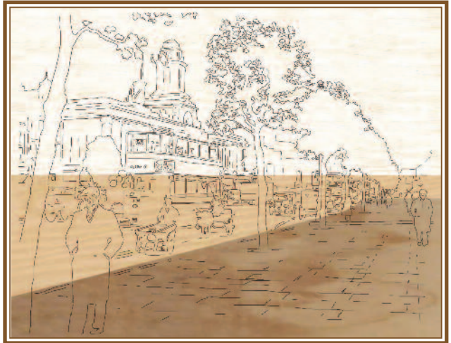
The design transferred onto the waster/background

Having selected my major and most important veneers, my next job was to block in the larger elements of the picture using those veneers. These were roughly, the top third of the picture a piece of clear grained Hornbeam for the sky area, the middle section was the Olive veneer for the roadway, and finally the weathered Holly was put in place for the pavement area.